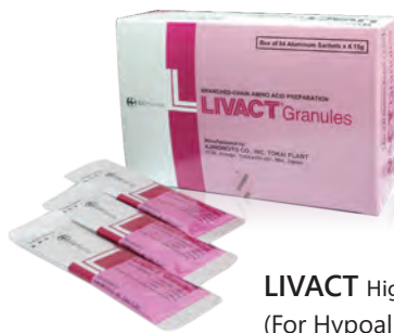
LIVACT High quality medicine from Japan (For Hypoalbuminemia and liver Cirrhosis)

which showed significant recovery of the patient with the treatment. In addition, we have a live stream via Zoom meeting for those who are unable to attend the meeting. LIVACT is a high quality BCAA from Japan for Chronic Liver disease patients with hypoalbuminemia. LIVACT is used by more than 50 specialist doctors in Laos already for their treatment.