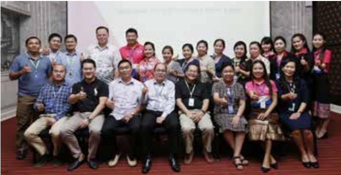
VIP Customer tour on 15th-16 May 2018

Unison Laboratories and Ai Ken Pharma invited VIP customers to Unison laboratory factory in Bangkok to observe their high quality production facility. Customers visit production facility, R&D facility, Laboratory and warehouse which has certified with PIC/S GMP, ISO 9001, ISO 14001, ISO 5001 and Green Industry Award. They have also joined Unison Ai Ken joint roundtable meeting and provided highly valuable and priceless advice to the future of Ai Ken Pharma for their high-expected better service to Laos healthcare professionals and patients. Ai Ken Pharma take those advice with promise and appreciation.