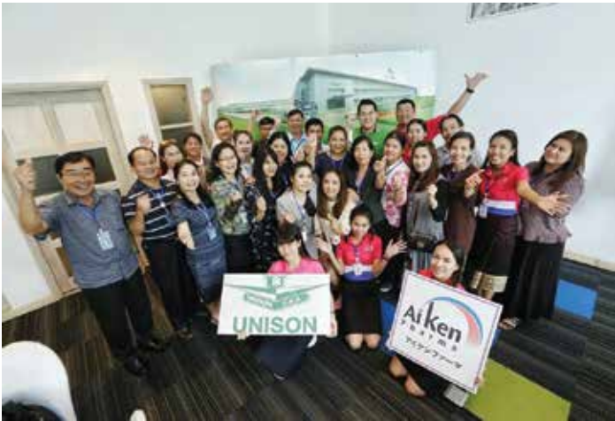
VIP Customer tour on 20th-21st July 2018