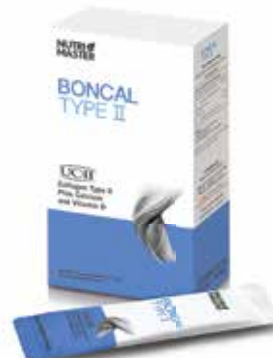
Boncal collagen type II