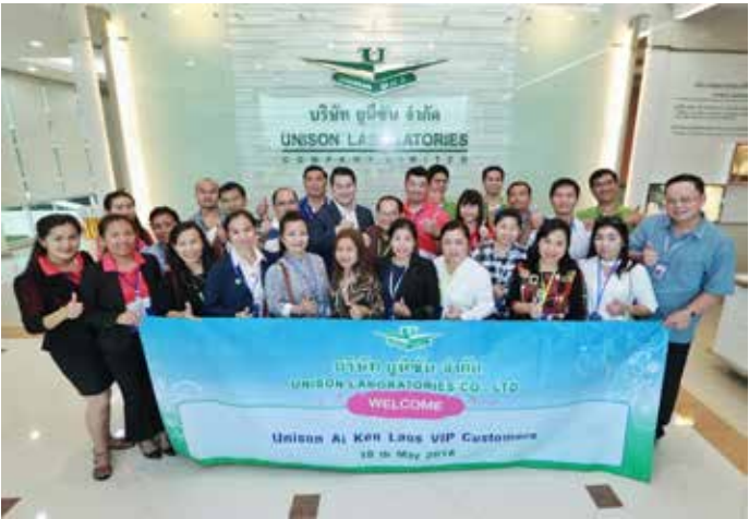
VIP Customer tour on 15th-16 May 2018